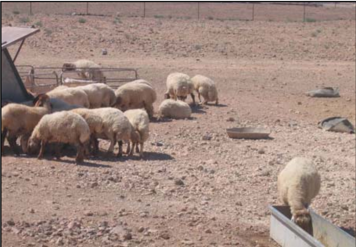
Fig.F6: Sheep flock being fed on imported barley