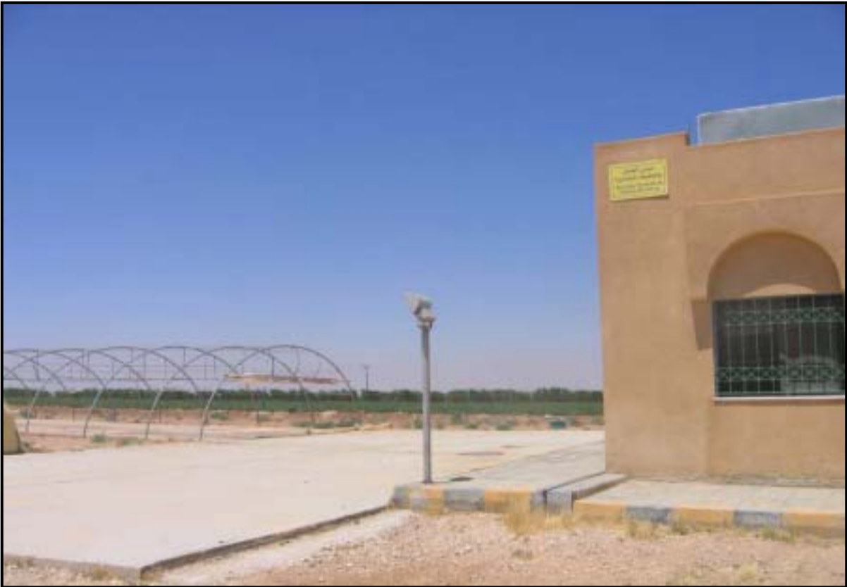
Fig.F5: The honey-making facility (right) and tomato drying floors